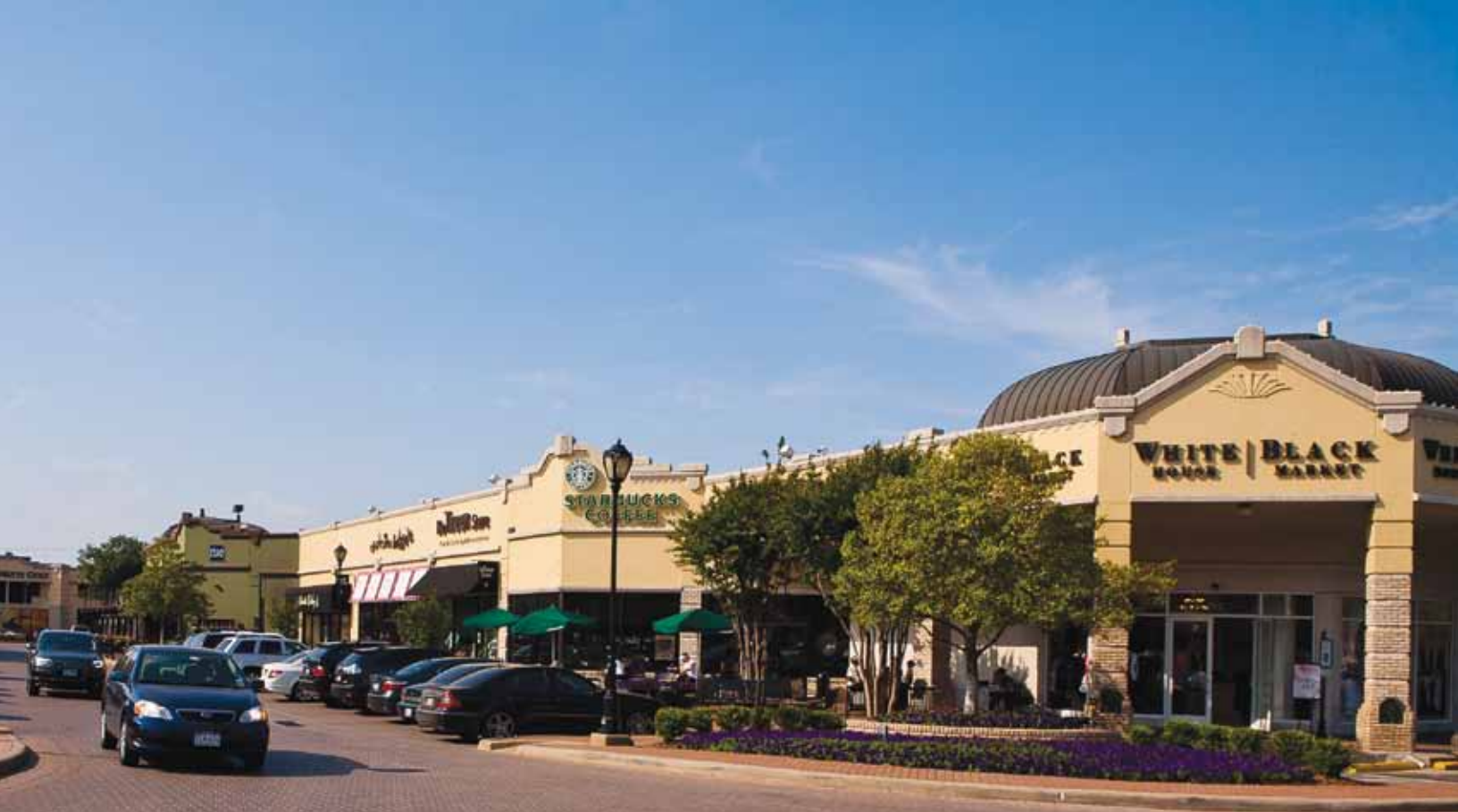
Table 8. Texas and U.S. Populations